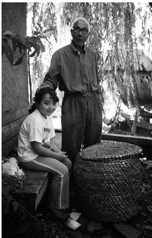
Escrelho expert, 87 years old, Bragança, Trás-os-Montes, September 2004.